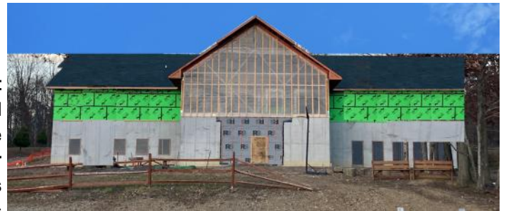
Lodge at the end of 2024

At the end of 2024, we had spent $1,007,872.73 on the lodge and successfully enclosed it for winter. We are thankful to our great God for miraculously supplying for this building. As a small ministry, God's provision has been overwhelmingly generous.