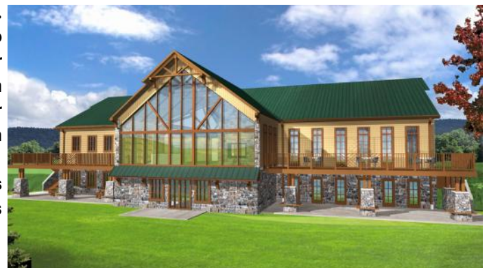
Projected building at the end of 2025

Please pray with us concerning the $224,000 needed for this portion of the project. As we watch the Lord provide, let us simply remember: