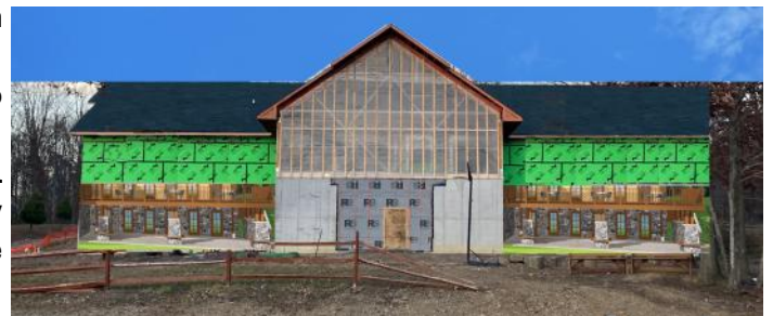
First step of 2025—Front Decks

Stonework —Finally, we aim to install the stonework on the front of the lodge.