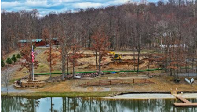
Starting to Dig

Helping you to feel the Pulse of Servant's Heart