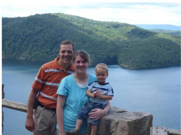
Director of Buildings, Construction & Grounds

Pray with us that these significant changes at Servant's Heart would continue to bring glory to God.